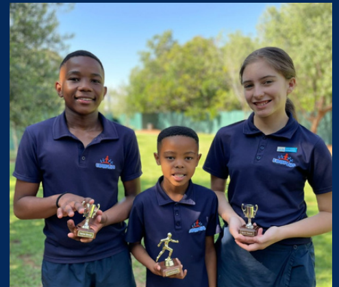
Senior Soccer Trophies